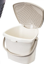
Sure-Close Kitchen Collector $5