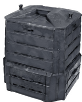
SoilSaver Compost Bin $45

Ready to start collecting food scraps and composting at home? Addison County Solid Waste Management District has the supplies you need. You can purchase compost bins, kitchen collectors, and Green Cone Solar Digesters at the District Transfer Station in Middlebury. Stop by our compost demonstration area to see them in action or attend one of our free workshops for composting tips and tricks.