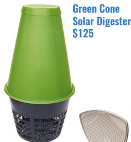
Green Cone Solar Digester $125